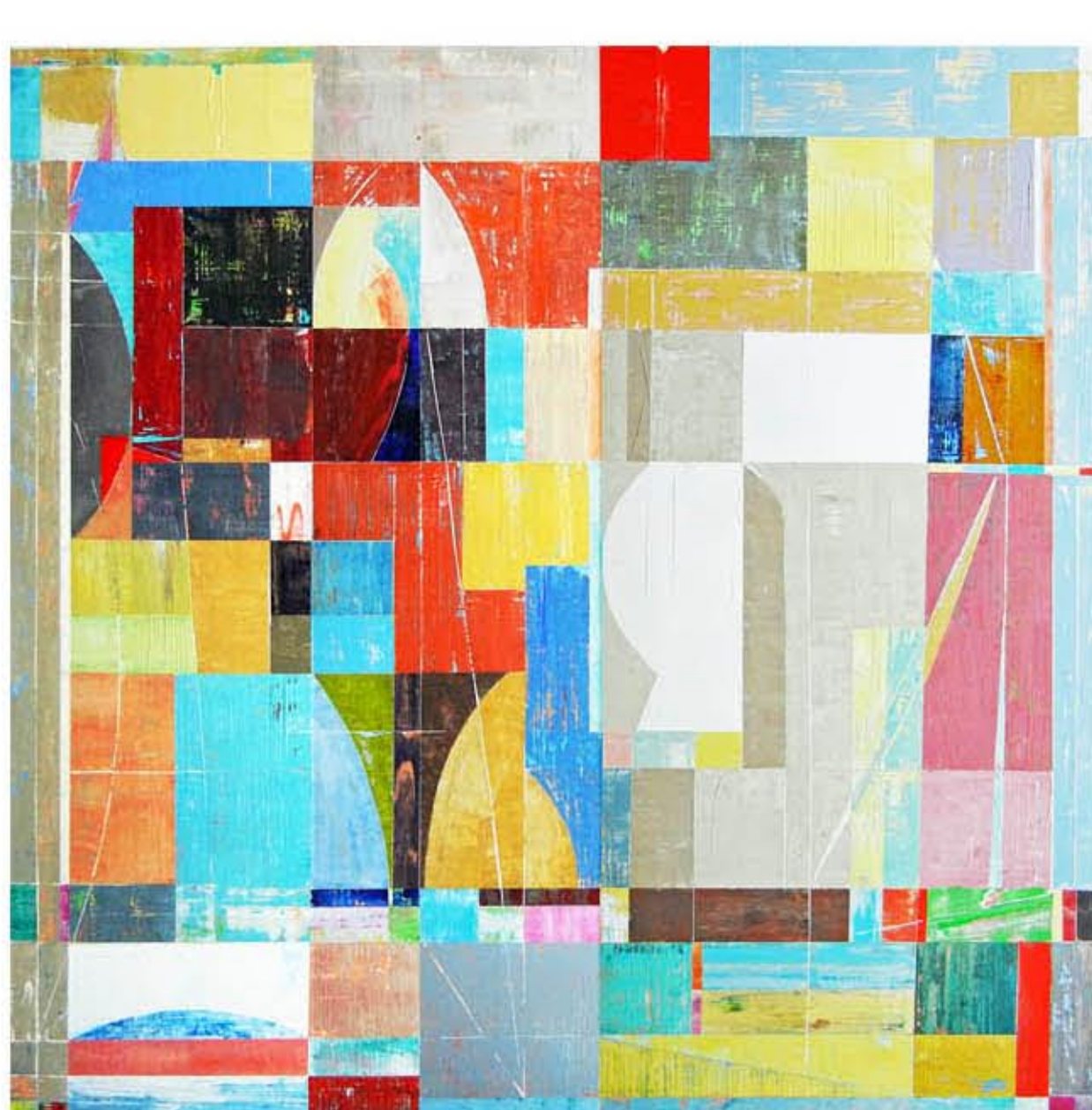
'THE GAZE' A/C 72"X 72"