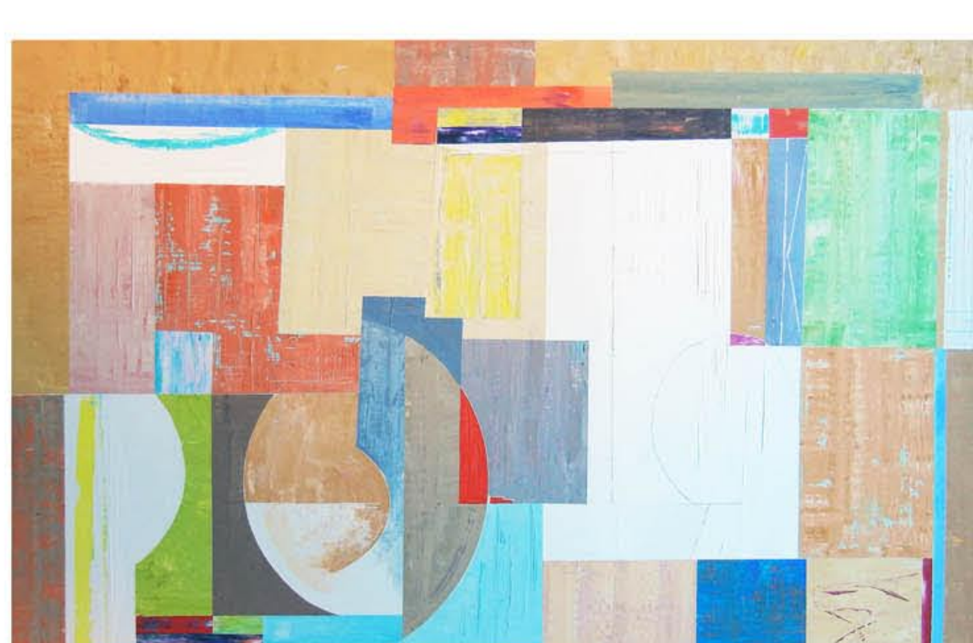
'APRES MIDI' A/C 54"X 78"