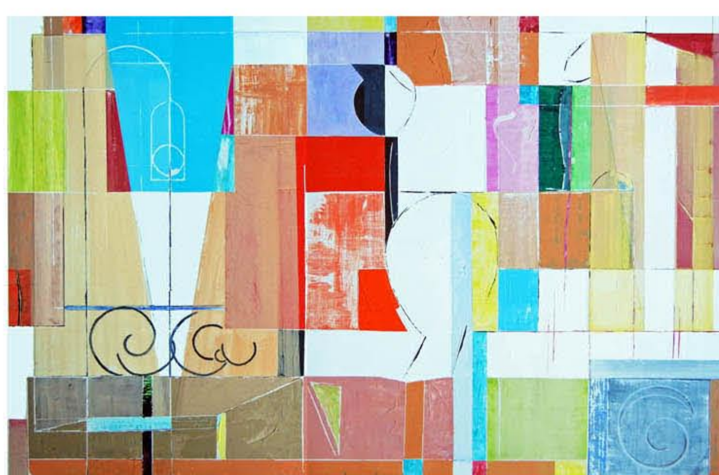
'THE MUSE' A/C 54"X 79"