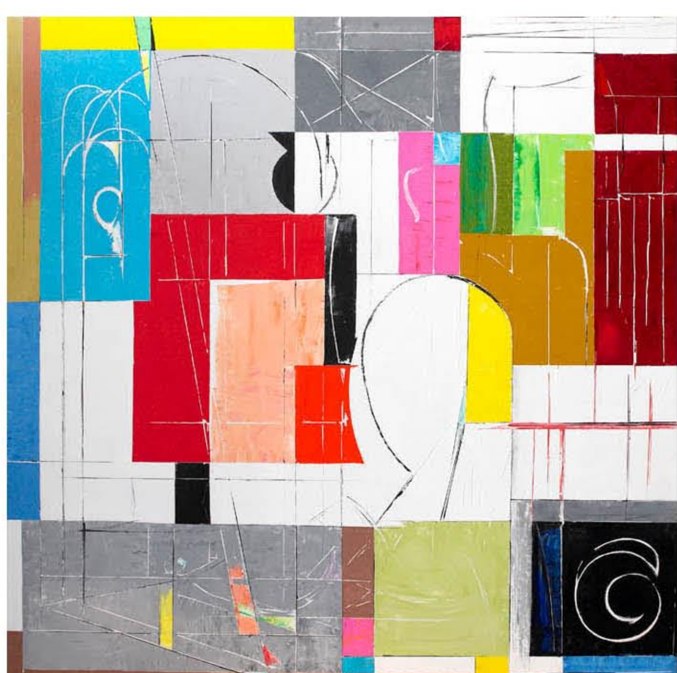
'MUSE' O/C 72"X 72"