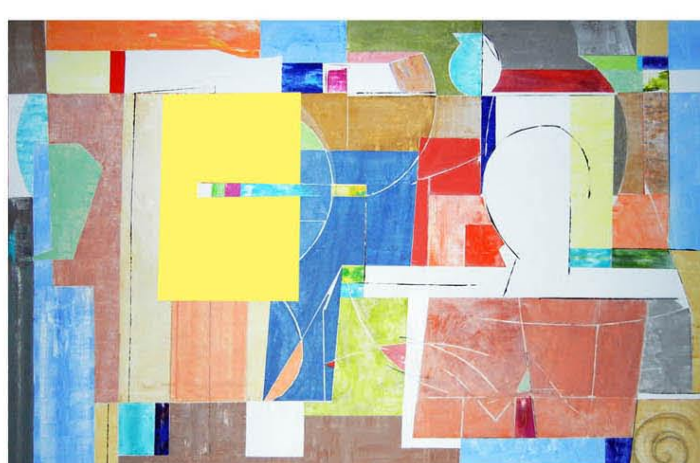
'TANGERINE' A/C 54"X 79"