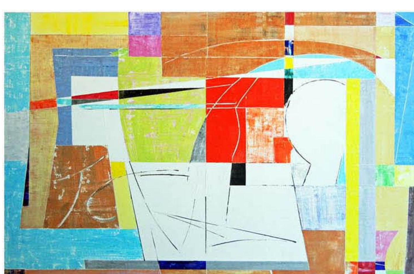
'INTERVIEW' A/C 52"X 78"