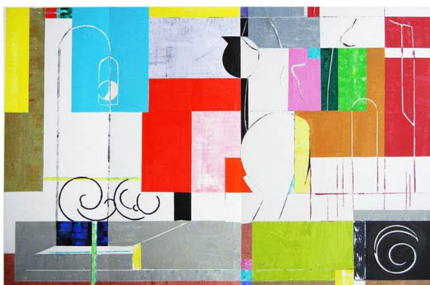
'MUSE A' A/C 54"X 79"