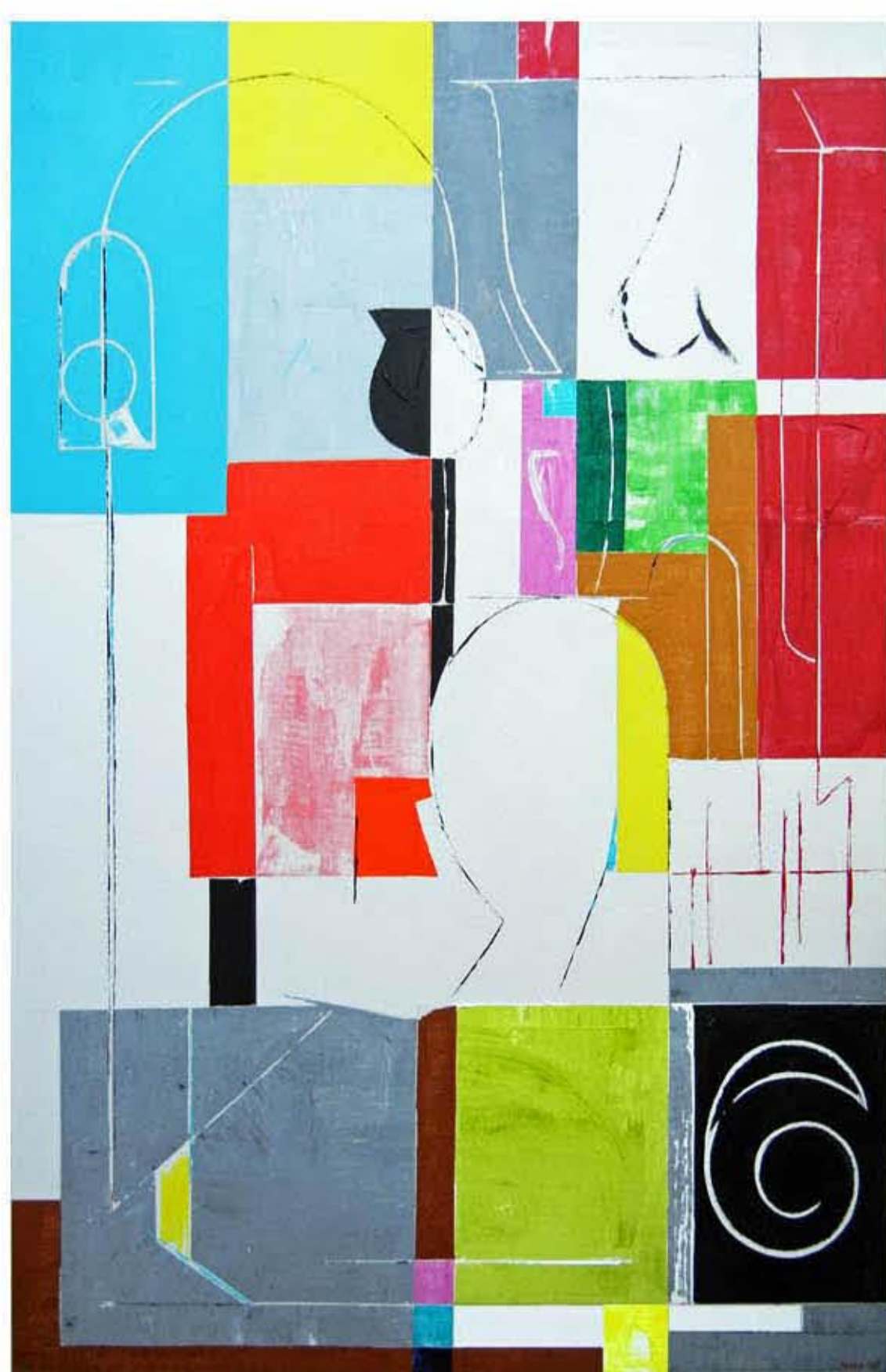
'NEW MUSE' A/C 79"X 54"